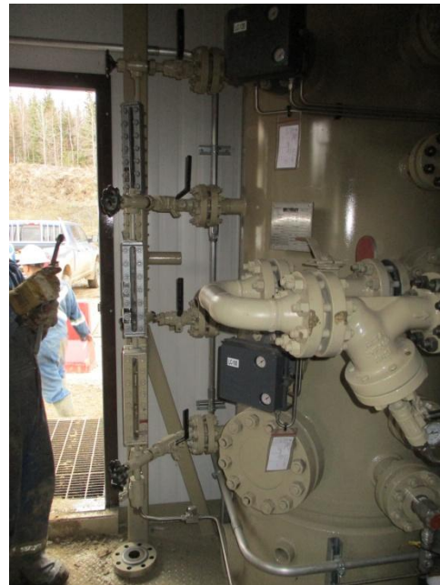
08 - Sight glasses