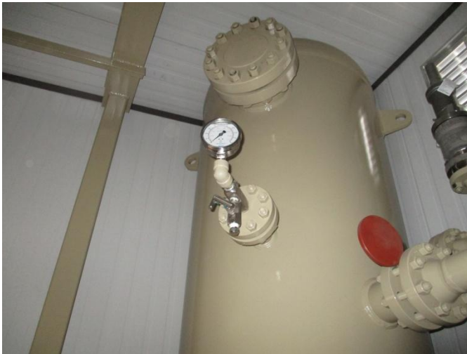
07 - Pressure gauge