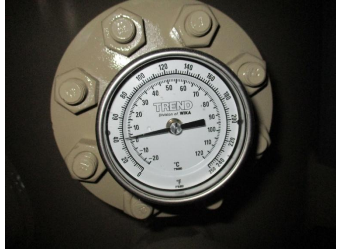
06 - Temperature gauge