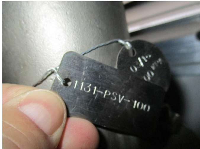
04 - PSV tag