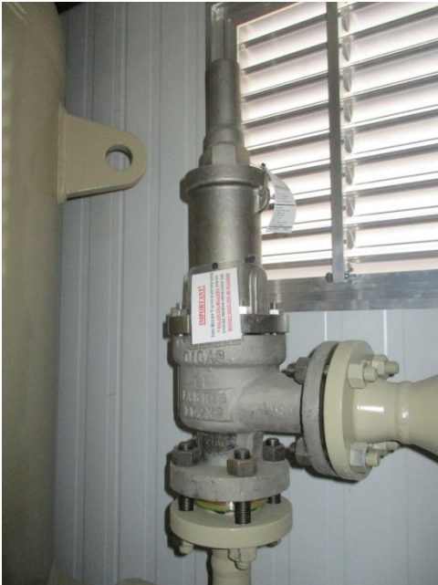
03 - PSV