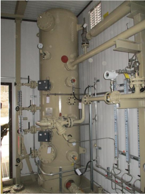
01 - Vessel overview