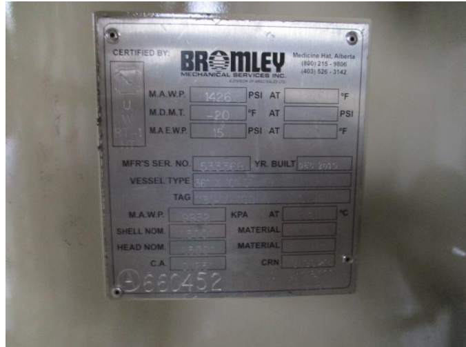
02 - Nameplate