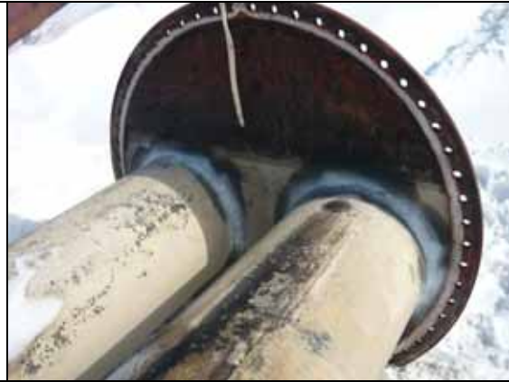
fire tube bolting flange