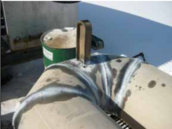
fire tube elbow