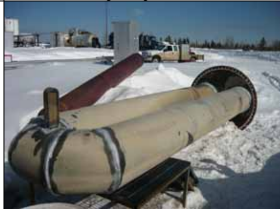
fire tube with support brace